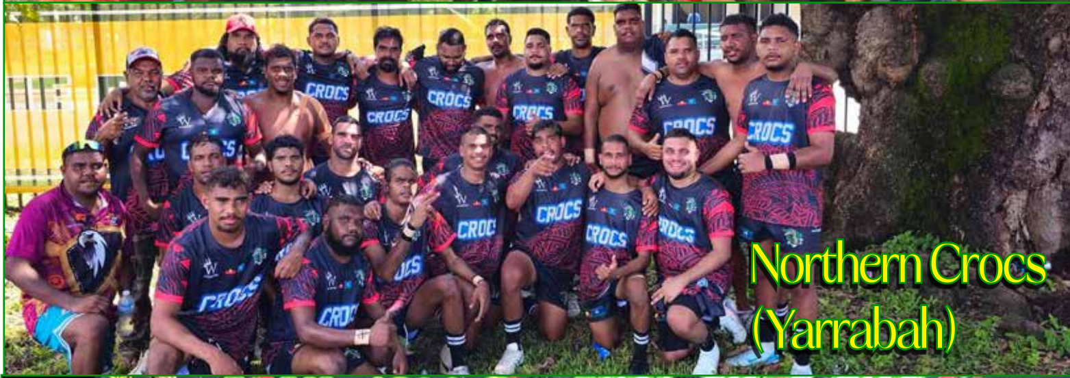
Northern Crocs (Yarrabah)