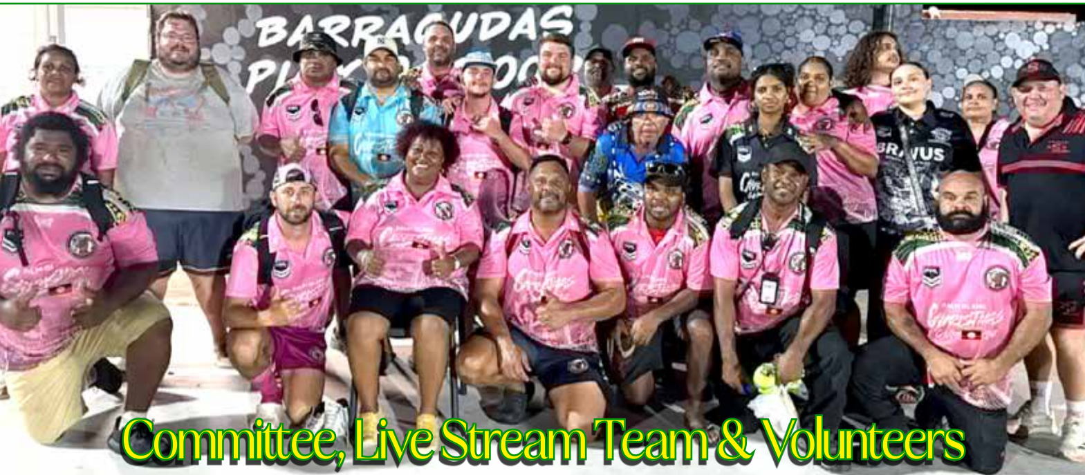
Committee, Live Stream Team & Volunteers